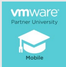
VMware Partner University Mobile Application Icon

The VMware Partner University Mobile app is VMware's updated, partner specific, tablet and phone-based application that provides partners with their e-Learning and enablement tools and content in a single mobile application. The secure portal requires login using your existing VMware Partner Central credentials and is available for both iOS and Android platforms. The application continues to provide your e-Learning training in either an online or offline manner, as well as providing enablement tools like Partner mToolBooks, Sales Bytes and Launch Playbooks and review previous VMware event presentations and vmLIVE recordings. Using the VMware Partner University Mobile app, you're able to learn where, when and how you want to.