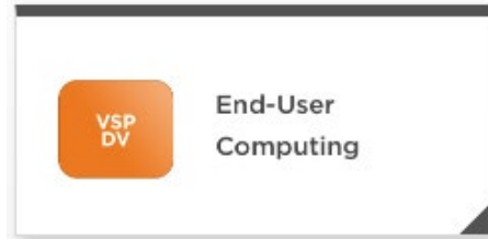
Figure 2 - Solution Area Tile

By leveraging a native mobile application rather than a device-based web browser, you have the ability to not only view, but also download content to your device. Take advantage of this capability for offline viewing at your convenience when you may be without internet access, such as a plane flight.