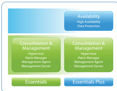
VMware vSphere Essentials editions

VMware vSphere Essentials editions are all-inclusive packages that enable you to virtualize and consolidate many application workloads onto three physical servers running vSphere and centrally manage them with VMware vCenter™ Server for Essentials.