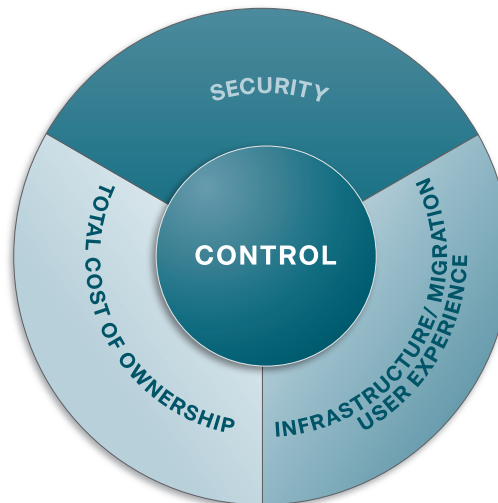
Figure 1. Cisco and VMware Deliver a Comprehensive, Centralized Virtual Desktop Solution That Gives Companies Superior Control Over Security, Infrastructure, Migration, and Total Cost of Ownership While Maintaining an Outstanding User Experience

The need to regain control over data and to rein in the ever-increasing cost of maintaining a personal computer for each employee has made desktop virtualization a top priority in many companies. Cisco® Desktop Virtualization Solution with VMware View centralizes the components of the desktop in the data center to enable exceptional control of applications and data while improving IT's capability to manage and deliver desktops. This solution helps reduce IT costs and enables flexible access and an improved experience for end-users (Figure 1). The Cisco Desktop Virtualization Solution with VMware View is delivered as part of Cisco's Virtual Experience Infrastructure (VXI), providing an open end-to-end service-optimized infrastructure for workplace virtualization.