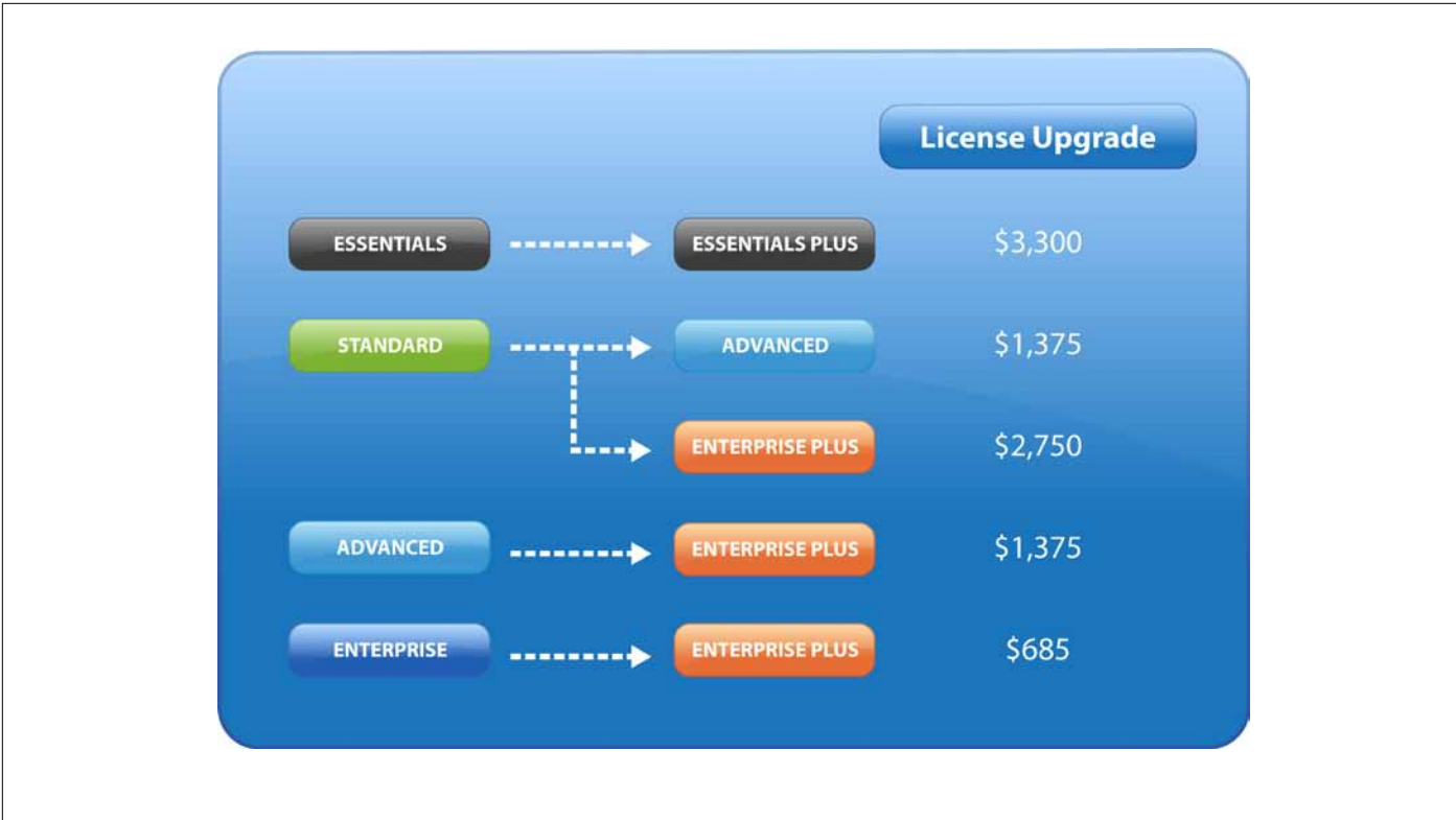
Figure 3 Upgrade Paths among VMware vSphere Editions

When customers upgrade supported licenses to a higher VMware vSphere edition, the original license key is deactivated and a new license key is issued for the upgraded edition. The SnS fee is then calculated. This new SnS contract will be extended by the value remaining on the base edition. This process ensures that only a single license key exists that has a single SnS contract with a single termination date. This simplifies renewals.