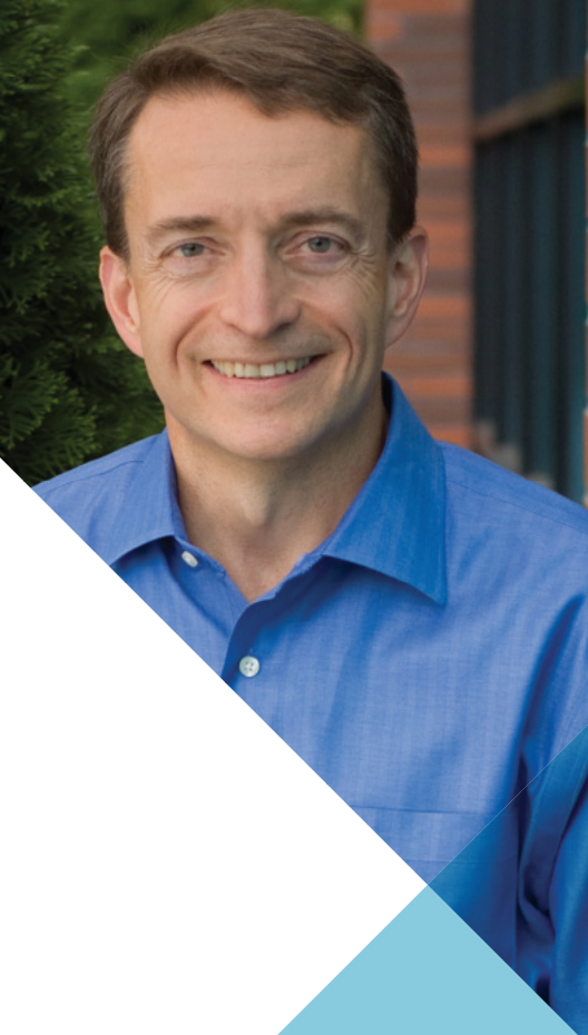
PAT GELSINGER CEO, VMWARE

In these pages, you'll see the possibilities VMware customers are realizing, and we hope they inspire you. Explore, and then let us know how we can help you on your journey to what's possible.