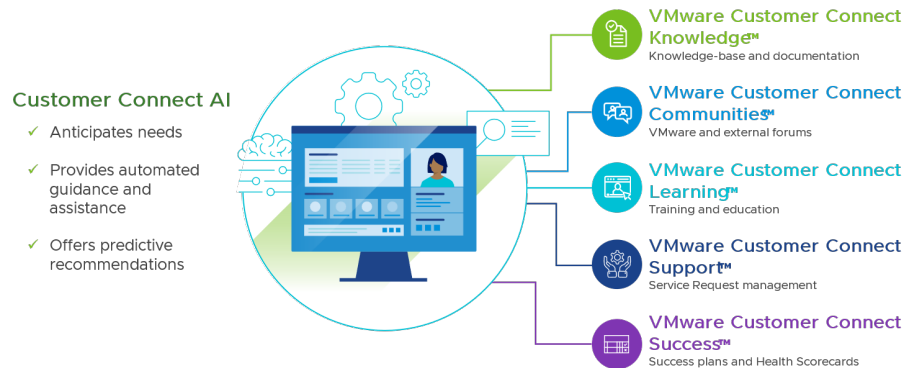
Figure 1: The VMware Customer Connect ecosystem.

As a VMware Customer Connect Pacesetter you will gain access to the newest features and updates before anyone else. You will have an opportunity to engage with our design teams and provide feedback on the features you find most valuable. You must become a registered Pacesetter Program member to participate. Join our Pacesetter Program now .