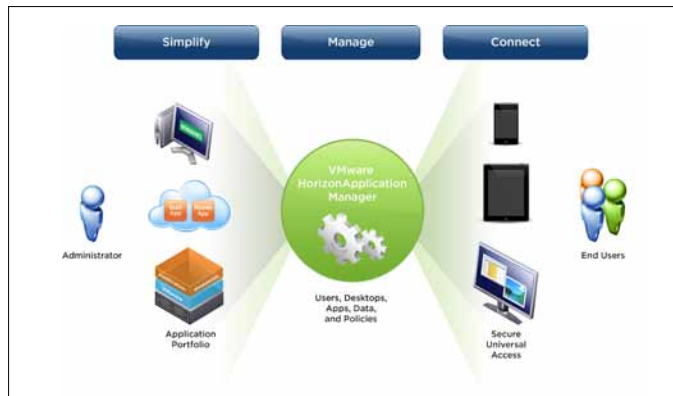
Figure 2. Simplify, manage, and connect any enterprise applications to any end-users regardless of device.

A. Horizon Application Manager bridges the gap between the private and public cloud, enabling you to maintain high security levels. Organizations can control which users have access to which applications, in both the public and private cloud. This capability extends to contractors or temporary workers. Now, for example, with a click of a button you can ensure that a user has been removed from the directory.