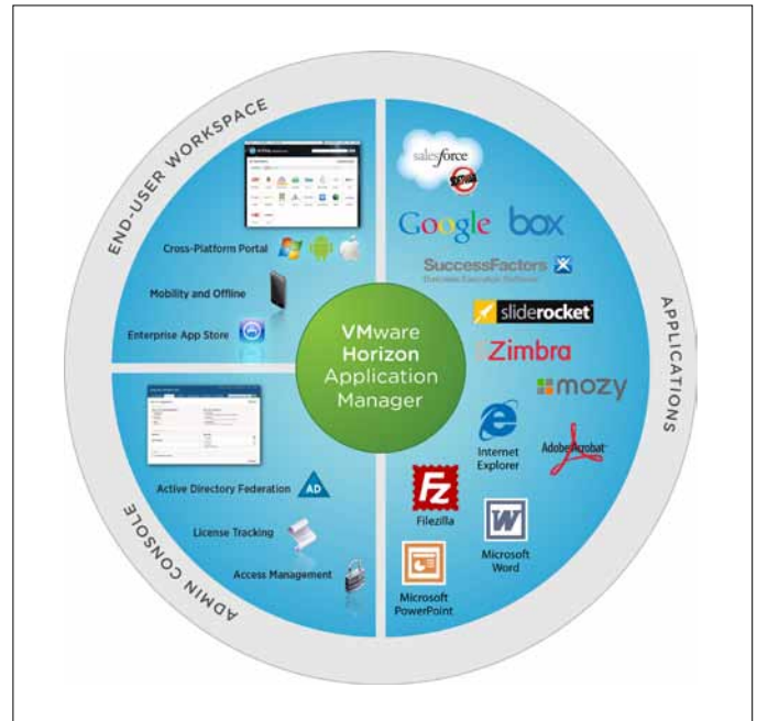
Figure 3. End-to-end applications management for Windows, SaaS, and enterprise web applications.

Horizon Application Manager, hosted by VMware, is offered as a per-user, per-year subscription. For more information, go to http://www.horizonmanager.com .