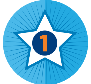
UNIFIED MANAGEMENT THROUGH AN OPEN AND EXTENSIBLE PLATFORM