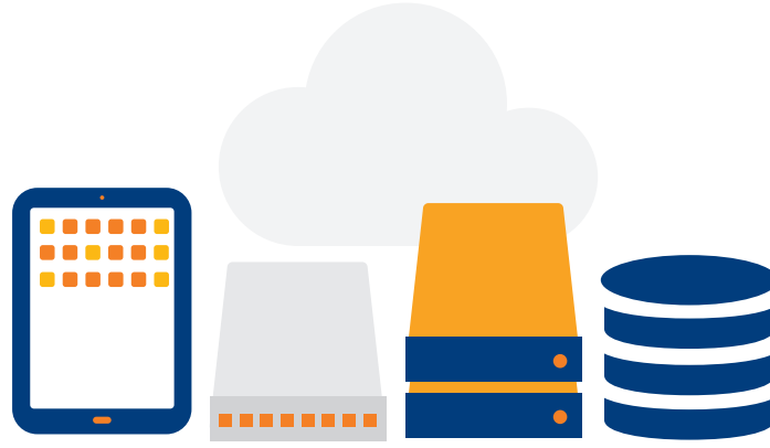
FROM APPS TO STORAGE