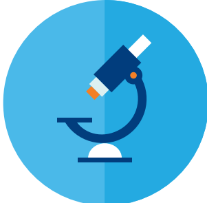
STORAGE AND NETWORK VISIBILITY