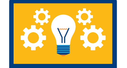
SELF-LEARNING MANAGEMENT TOOLS