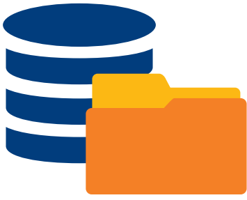
ALL MACHINE DATA

Wake up from the nightmare with VMware® vRealize™ Operations Insight, a unified management solution with predictive analytics, for performance management, capacity optimization, and real-time log analytics.