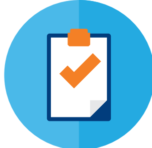
VSPHERE HARDENING, CHANGE, CONFIGURATION AND REGULATORY COMPLIANCE