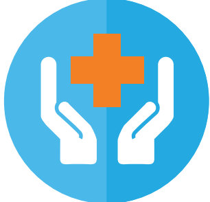
PERFORMANCE AND INFRASTRUCTURE HEALTH MANAGEMENT