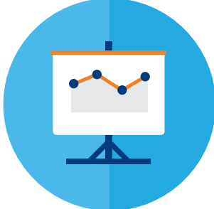
CAPACITY PLANNING, MODELING AND OPTIMIZATION