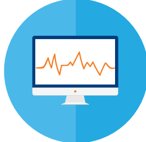
REAL-TIME LOG ANALYTICS