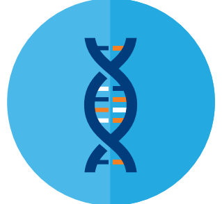
APPLICATION DEPENDENCY MAPPING