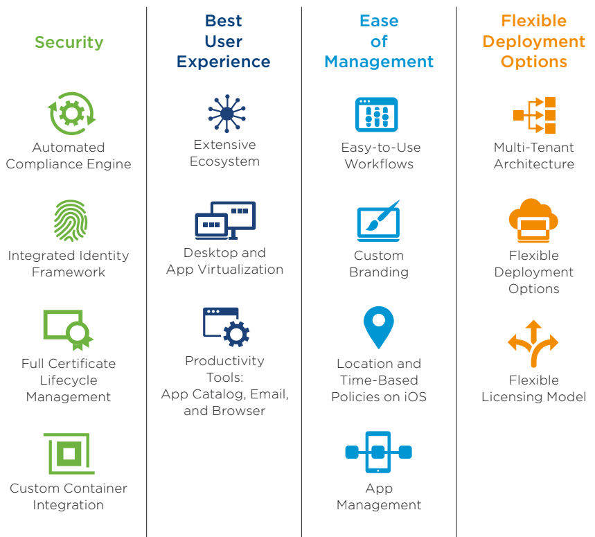
Figure 1: VMware Workspace ONE Provides a Platform for Now and the Future

VMware Workspace ONE is a simple and secure enterprise platform that delivers and manages any app on any smartphone, tablet, or laptop. It begins with consumer-grade self-service, single-sign-on access to cloud, mobile, and Windows apps, and includes powerfully integrated email, calendar, file, and social collaboration tools that delight employees. Workspace ONE high-level advantages over IBM MaaS360 can be grouped into four main categories: