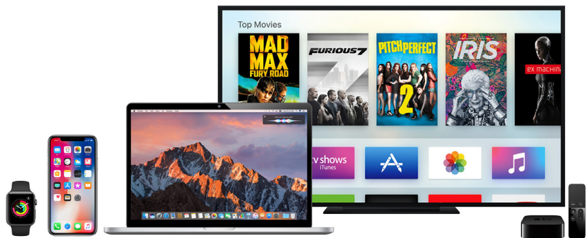
Figure 1: VMware Workspace ONE Supports All Types of Apple Devices

Positioning VMware as a leader, the IDC MarketScape: Worldwide Unified Endpoint Management Software 2017 Vendor Assessment cites “macOS management features such as Mac app delivery, pre-deployment/staging system configuration, and support for macOS via Apple’s Device Enrollment Program (DEP).