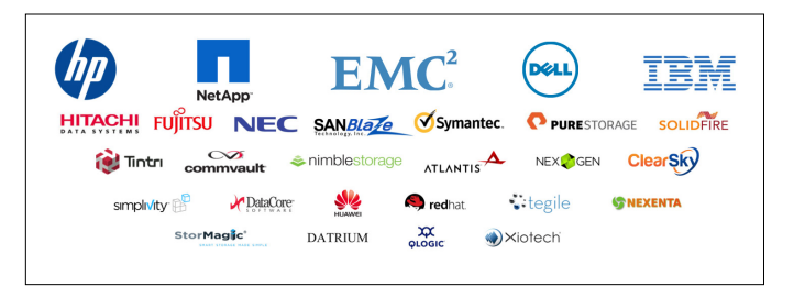
Figure 2 - Virtual Volumes Partner Ecosystem

Virtual Volumes is an industry-wide initiative that will allow customers to leverage the unique capabilities of their current storage investments and transition without disruption to a simpler and more efficient operational model optimized for virtual environments that works across all storage types.